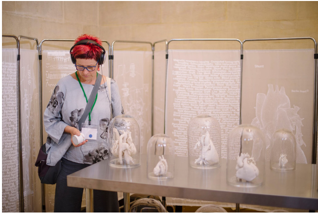
Figure 2 Visitors could listen to the soundscape on headphones for a more immersive experience.

free-text questions. It was administered before and after a viewer had experienced the piece, including the soundscape. Two researchers were always present, invigilating the artwork and collecting questionnaires from the viewers, as well as helping them to set up the headphones and answering any questions they may have on the genesis of the piece or on the 3D heart models.