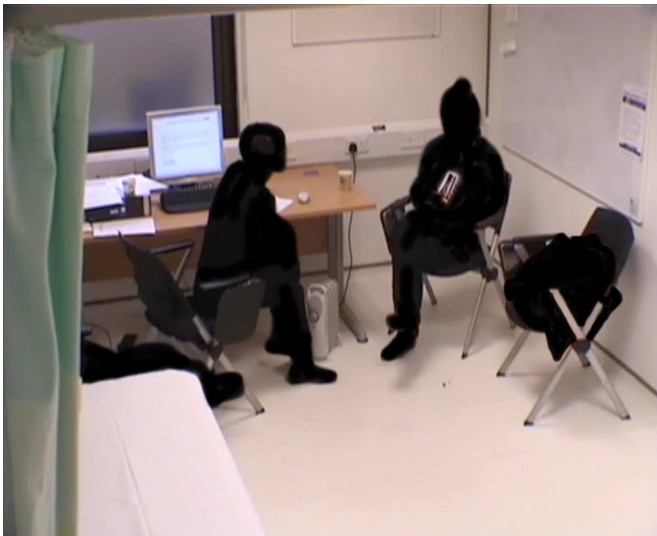
Figure 2 Anonymised screen grab of video footage from this consultation (filmed with consent) showing the non-verbal interaction.