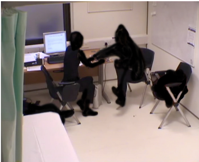
Figure 5 Anonymised screen grab of video footage from this consultation (filmed with consent) showing the non-verbal interaction.

This tendency to provide positive and empathetic responses was observed more generally in interactions around the cards across the 17 consultations. The computer-aided comparison between the interactions around the images and the rest of the consultations shows that clinicians use words suggesting positive evaluation much more frequently around the cards (eg, “fascinating”). Like the patients, they also show a statistically significantly higher usage of words such as ‘feel’, but in most cases the verb is used in reference to an experience of the patient’s, whether to ask for clarification or to show understanding (eg, “This is about how you feel frustrated and tense, yes?”). Moreover, as we have already mentioned, consultants also show higher frequencies of metaphorical descriptions of the quality of the patient’s pain, again to check or confirm their understanding of the patient’s experience (“Okay. So it’s burning, sharp, yeah?”). This further exemplifies the images as a third space, a shared reference point within and against which to check meaning.