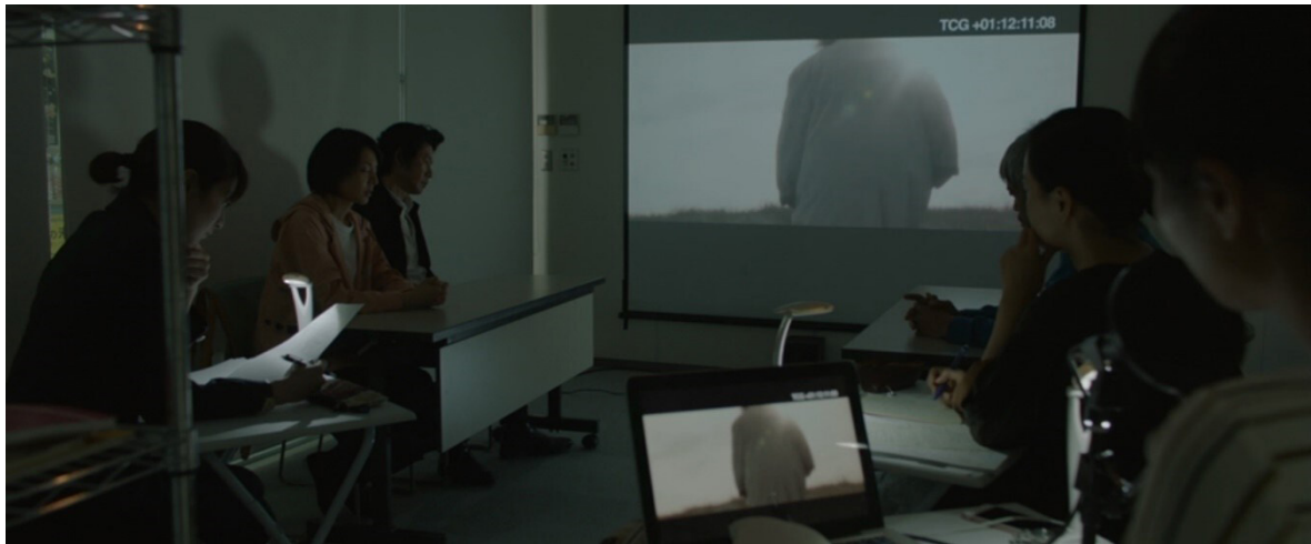
Figure 3 © 'Radiance' film partners/Kinoshita, Comme des Cinémas; Kumie: Misako and her team watch the audio-described film at the White Light studio.

Each of these exercises adds a different aspect to the understanding of audio description.