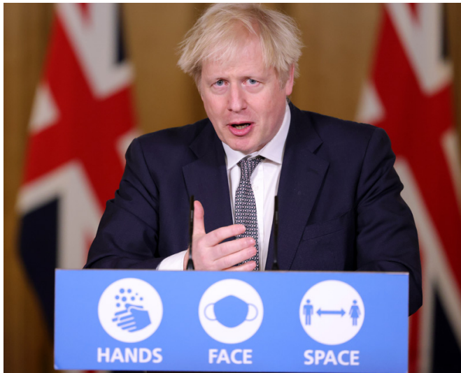
Figure 3 Prime Minister's statement on COVID-19: 16 December 2020. Contains public sector information licensed under the Open Government Licence V.3.0 ( https://commons.wikimedia.org/wiki/File:Hands,_Face,_Space_(Johnson_press_conference).png )

the COVID-19 virus, government coronavirus briefings promise to provide reliable and transparent public health information. They are thus part of the essential effort to control narratives 'regarding [COVID-19's] scientific and clinical attributes and pandemic containment efforts', as Laurie Garrett argues in 2020 (Garrett 2020, 943), and to ground health messaging in fact despite the onslaught of misinformation concerning both the virus and the vaccine.