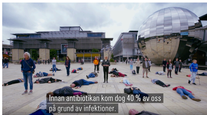
Figure 4 The truth about ... antibiotics, BBC 2019.

The most striking visual metaphor is one in which 60 extras stand in a square, representing the population of Great Britain. The voice-over tells us that ‘almost half of them could die if there weren’t antibiotics’. As Angela Rippon walks through the square while knocking over people, the voice-over tells us these deaths could be caused by the lack of access to caesarean sections, care for preterm babies, chemotherapy, and routine surgeries such as hip and knee replacements. At the end of the visual metaphor, Rippon stands in the square and tells us that ‘before antibiotics, 40% of us would die from infection (figure 4). Without antibiotics we are going to return to the dark ages of medicine when even a simple scratch could be a death sentence’.