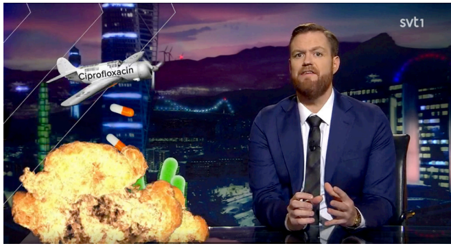
Figure 5 Svenska Nyheter (Swedish news), Sveriges Television (SVT) 2019.

that ‘We are on the way back to a time before penicillin was discovered, when one could die of a paper cut’. He then says that this is not a scary future scenario, but something that is happening now and cites figures that each year about 33 000 die in Europe and 150–200 in Sweden from AMR: