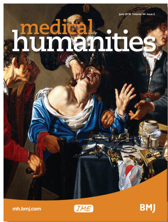
Cover image: 'An operator extracting a tooth. Oil painting by an unidentified painter, 16–, after Theodor Rombouts.' by Theodoor Rombouts.