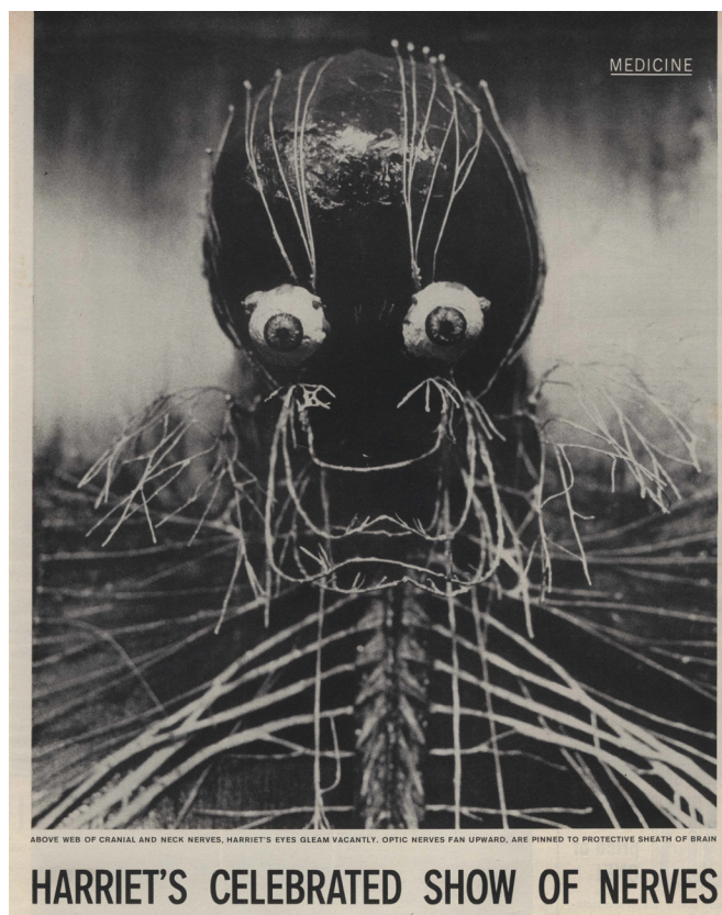
Figure 3 'Harriet's Celebrated Show of Nerves', Life . 8 February 1960, 59. Photograph by Sam Nocella. Public domain.

her body to the medical school. Her nervous system, the story goes, was dissected by Weaver, then preserved and mounted as a teaching tool and masterpiece of medical specimen preparation' (Hester 2021). Hester's article emphasised the fact that nearly all the details