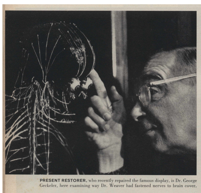
Figure 4 'Harriet's Celebrated Show of Nerves', Life . 8 February 1960, 60. Photograph by Sam Nocella. Public domain.

her body to the medical school. Her nervous system, the story goes, was dissected by Weaver, then preserved and mounted as a teaching tool and masterpiece of medical specimen preparation' (Hester 2021). Hester's article emphasised the fact that nearly all the details