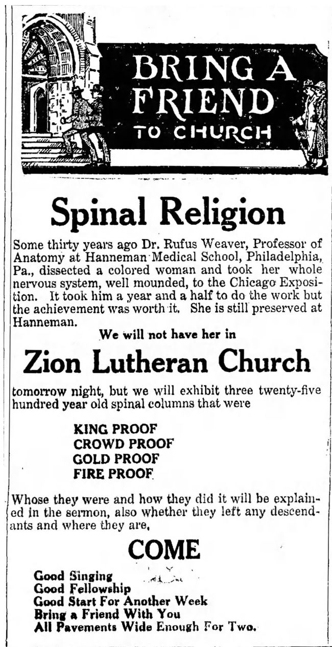
Figure 2 'Spinal Religion', Indiana Gazette . 17 April 1926, 9. Public domain.