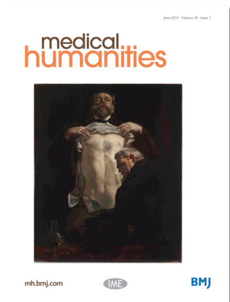
Cover caption: George W Lambert, Chesham Street , 1910. Oil on canvas, 62×51.5 cm, National Gallery of Australia, Canberra. Purchased 1993.

Receive regular table of contents by email. Register using this QR code.