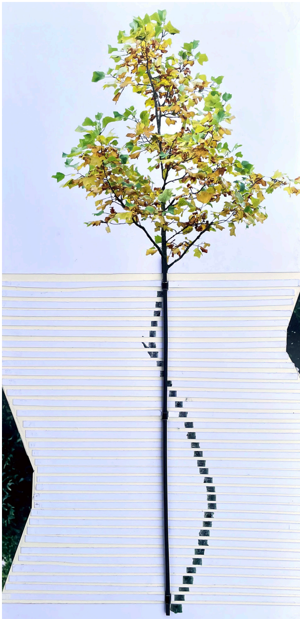
Figure 2 Participant artwork, Jamielee Stevenson 2022, mixed-media on paper.

cases, the participants (including all the parents) focused on employing artistic processes to create straightened trees out of ones that had grown with a measurable curve in the trunk. Others inserted additional ‘foreign’ objects into the 2D space of the artwork. Figure 2 shows how one participant inserted a long piece of black foamboard into her reassembled collage of an unusually straight tree, tape ‘straps’ were crafted to hold the 3D insert centrally within the image. Others also experimented with similar approaches, punctuating the main image by means of cutting slits/openings to fasten the added ‘upright’ in place.