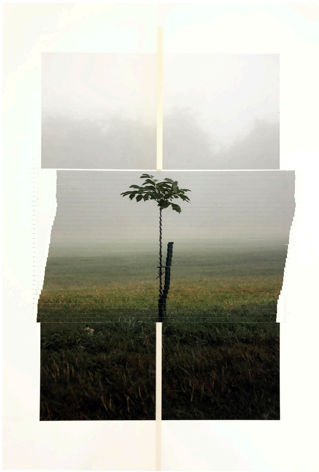
Figure 1 Straightened Sapling 2018, mixed-media on paper, © Catherine Baker.

same material and anchored in the same ground. Yet our perception is still one of straightness. The artwork (figure 1) consists of a photographic collage showing a staked sapling that has grown apart from its wooden support, taking a different direction from the one intended by staking. However, here it is shown horizontally sliced with the reassembled trunk following a perfect vertical line.