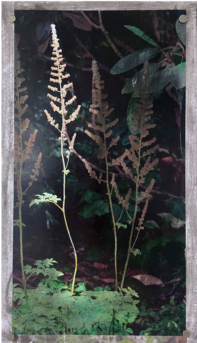
Figure 4 Participant artwork, Holly Smith 2022, mixed-media on paper.

that has grown with a bend in the stem that is situated amidst other straighter versions. She describes,