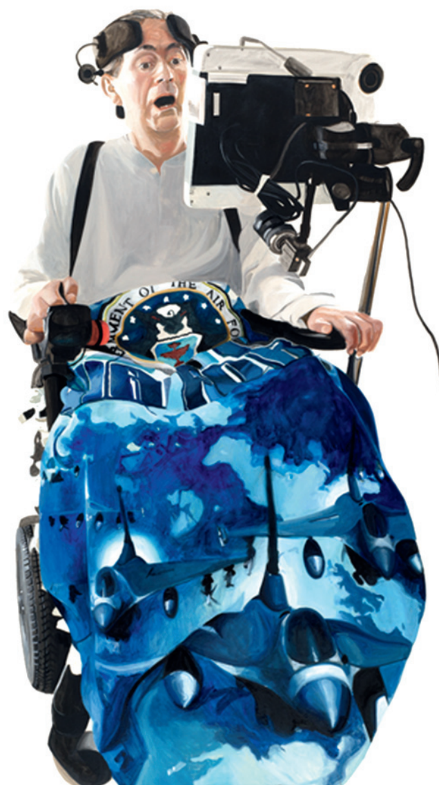
Figure 4 ‘Roger’, oil on canvas, 72 x 42 inches, 2007.

became ‘vulnerable’ in the sense that they allowed the artist to look at and draw them. Caregiver subjects appear thoughtful and strong in this way.