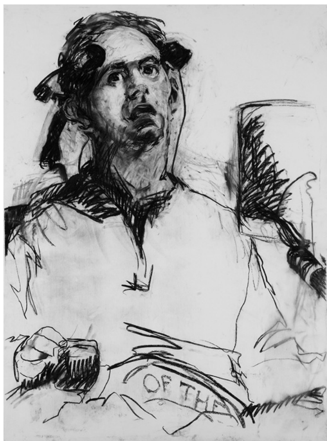
Figure 5 'Roger', charcoal on paper, 56 x 42 inches, 2007.

someone in the project and it has helped me see the vast expanse of those necessary for care."