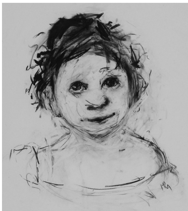
Figure 8 'Daisy', charcoal on paper, 44 x 32 inches, 2008.

In discussing our portraits, we both saw elements of each other which we had not seen (in life), but were very 'real.' Rob saw