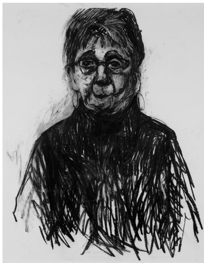
Figure 6 'Glenna', charcoal on paper, 45 x 42 inches, 2008.

Dolores later publicly explained that Roger wanted to help others overcome their fearfulness of people who are ill or suffering in some other way. He thought the study would help accomplish this goal while helping others learn about the importance of the personal aspects of care. As she appreciated