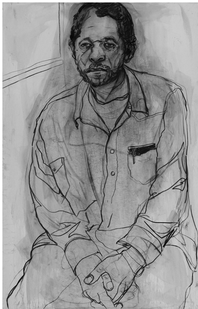
Figure 3 ‘Sebron’, charcoal on canvas, 72 x 42 inches, 2006.