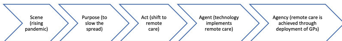
Figure 1 Narrative causality in period 1. GP, general practitioner.

There were also agent-purpose tensions. The purpose projected by the narrative was to reduce the spread of coronavirus (implicitly, to keep people safe and prevent deaths). One of the striking features of the early articles was their focus on new digital technologies as the agents through which the purpose would be achieved. There was little mention, for example, of the old-fashioned telephone—yet in reality most remote consultations in England from March to June 2020 occurred by phone (NHS England 2020). Thus, as narrativised in the mainstream media, the purpose (controlling the pandemic) motivates not the